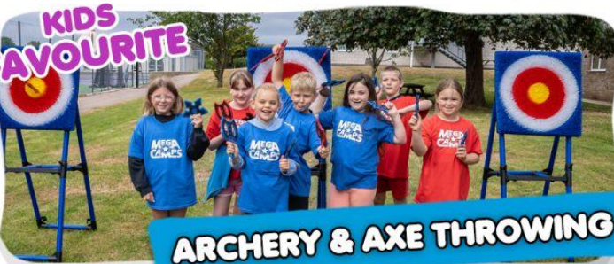
ARCHERY & AXE THROWING