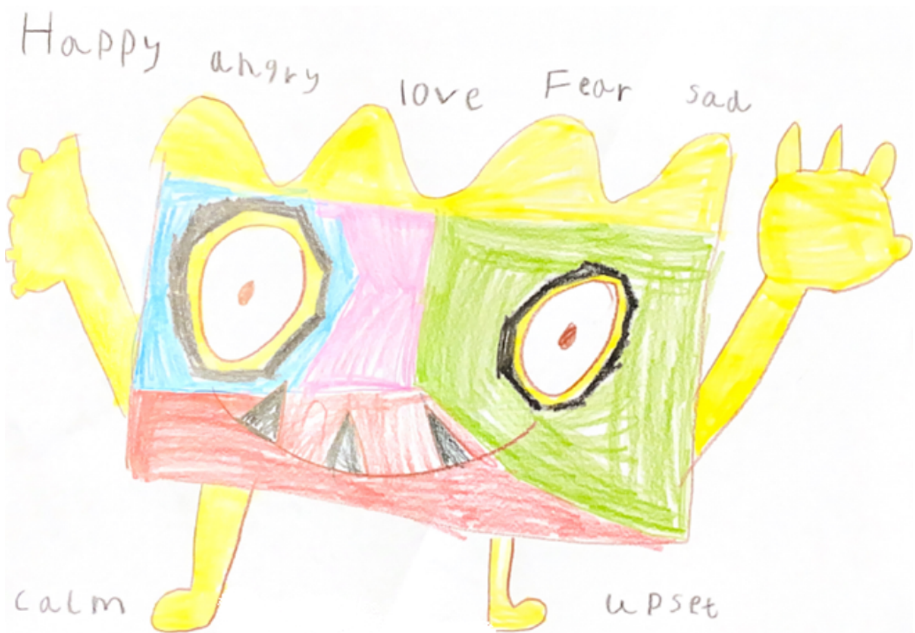
Colby, age 6

A joined-up approach to support the emotional wellbeing and mental health of children and young people