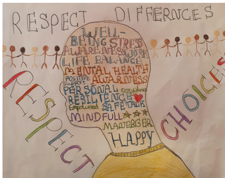
Jessica, age 10

Emotional wellbeing and mental health mean different things to different people. We all have mental health and we must look after it, getting the right support at the right time.